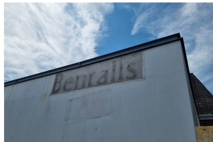
One of several 'ghost signs' that can be spotted around the town centre