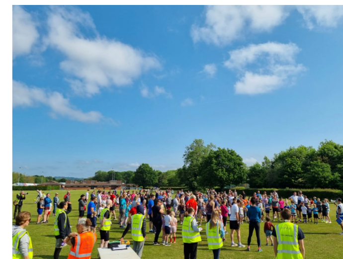
Tonbridge junior parkrun

To take part all you need is an athlete barcode, this can be downloaded and printed off as part of your one-time registration. Registration like the event is free and only takes a couple of minutes and can be done using this web address: https://www.parkrun.org.uk/register/