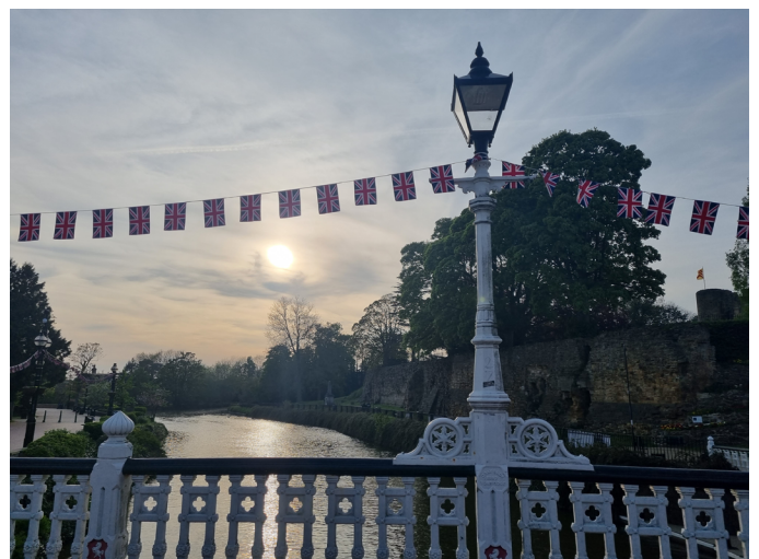
Tonbridge town bridge

Let's hope for a little more of the latter for some of the many events that are planned in the weeks to come (see further details below).